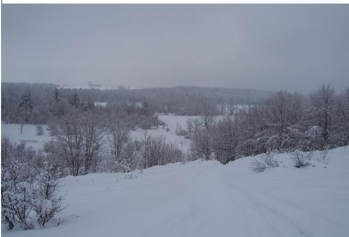
C7B looking south towards Westfall Rd

The AccuWeather.com forecast on Tuesday the 23^{rd} of February called for 12-26" of snow to fall between then and Friday the 26^{th} . At the time the