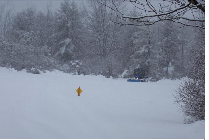
New Holland Sur-Trac approaches

Club Officer Nominations And Elections Are Upcoming! Get Active!!