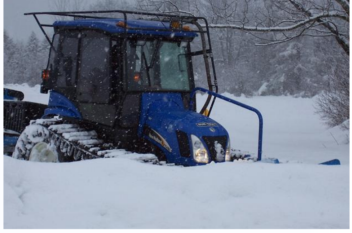
Busting a snow bank!

All of these actions allowed the Frontier Sno Rider trails to open for weekend use. By Sunday afternoon